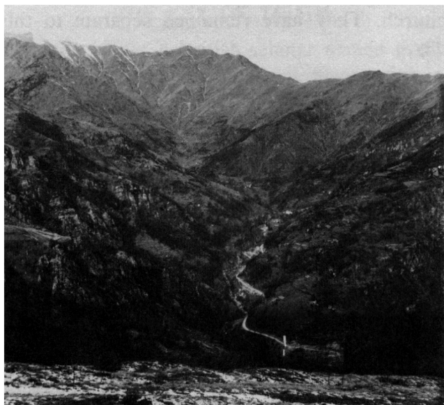
The Angrogna Valley in the Cottian Alps. It was in this area that the latter part of the Thyatira stage of God's Church was headquartered.

An event took place which totally changed Peter Waldo's life. It was the death of his close friend, which caused him to seriously consider the meaning of life.